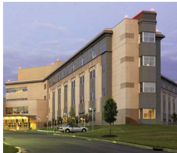
South Jersey Regional Medical Center ext.

Consistent with the HATP, the proceeds of the Series 2009 bonds were used to pay off outstanding debt related to Muhlenberg Regional Medical Center, which closed last year, and to refund outstanding indebtedness of its nearby sister facility JFK Medical Center, and renovate and expand JFK to meet the increased demands of the service area population. The bonds received an