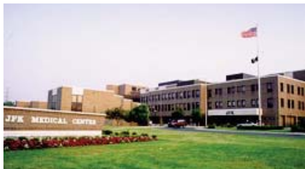
JFK Medical Center ext.

On June 18, 2009, the Authority issued $152,925,000 of bonds on behalf of The Community Hospital Group, Inc. (t/a JFK Medical Center ) through the Hospital Asset Transformation Program ("HATP").