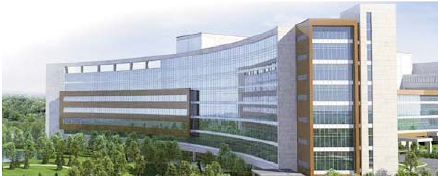
Rendering of Virtua's new hospital in Voorhees

Privately placed with Bank of America, NA, the bonds constitute parity obligations secured by mortgaged property and gross receipts of the hospital for the equal benefit of the holders of the remaining Series 1997, Series 2006 and Series 2008 Bonds. In addition, the term sheet gives the bank the right to put the bonds in five years. The bonds have a final maturity date of July 1, 2036.