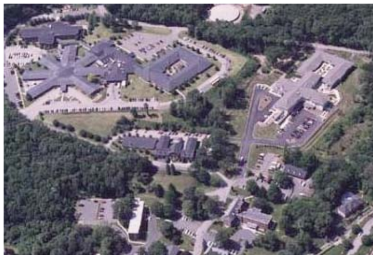
Aerial view of CHCC's vast campus