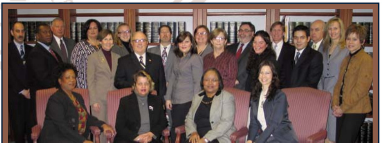
The Authority staff - January 2009