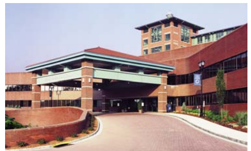
Holy Name Hospital exterior

The short-term market had been extremely unstable prior to the closing. Interest on seven-day variable rate bonds increased dramatically; the SIFMA index jumped from 1.79% on September 10th to 7.9% on September 24th. The Federal Government proposed a plan to help restore rates to their historic levels, though there was no assurance as to how long that would take. Holy Name decided to proceed with the financing and the mid-November issue received an all-in true interest cost of 5.20%.